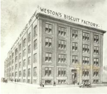
Weston's Biscuit Factory, Peter St., Toronto, 1910.