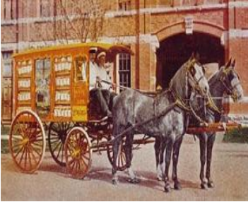
A decorative Model Bakery bread wagon, hand-coloured postcard, Toronto, ca. 1908.

While George Weston was known throughout the city for his bread, early in the new century he began making biscuits. The bread business had always been very competitive, but so too was the biscuit trade, with Christie, Brown & Co. being the big Canadian biscuit maker. Instead of spending a lot of money on advertising, though, George employed other, more innovative approaches, as described by one company history: