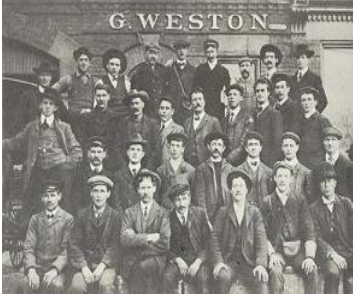
Model Bakery bread route salesmen, Soho and Phoebe streets, Toronto, ca. 1900.

With his Model Bakery in production and his wagons busier than ever, plying the roads of Toronto and its suburbs, everything seemed to be going well for George Weston. But soon he began hearing unsettling reports from his bread route salesmen. Apparently he was being undercut by the competition.