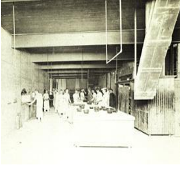
Bakers tend to their ovens at the Model Bakery, ca. 1897.

In planning his Model Bakery, George Weston traveled to different countries to study the latest in machinery and production methods. The Evening Telegram reported how “his new establishment is a composite of the best ideas he has been able to gather.” The end result was a carefully laid-out manufacturing process that maximized efficiency.