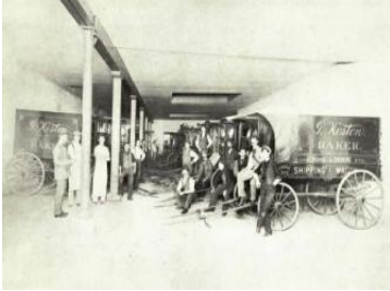
The Model Bakery wagon room with salesmen and their rigs, ca. 1897.

It wasn't only the Model Bakery's capacity to mass-produce bread that attracted attention, though, but also its high standards with regards to cleanliness and neatness.