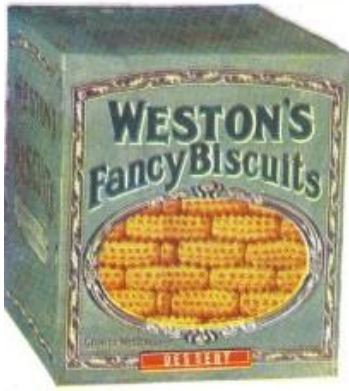
Weston's packaging, ca. 1920.

George Weston had built his reputation on his bread but early in the new century he began moving beyond bread into biscuits. Cakes and confectioneries had been a profitable sideline for sometime but now his Model Bakery Co. started baking fancy biscuits, or what we would today call cookies. Sold in brightly coloured tins that served as in-store displays, the new line quickly began selling beyond Toronto. By 1904, some 35 stores in Ottawa were receiving regular shipments of Weston's Fancy Biscuits , along with cakes. The company also started selling soda biscuits. One advertisement for Weston's Royal Cream Sodas described the new product as “superior to most other Biscuits” and noted they were the only “air-tight packaged” sodas available in Canada.