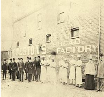
Bakers and bread route salesmen at George Weston's bakery on Sullivan Street, Toronto, ca. 1895.