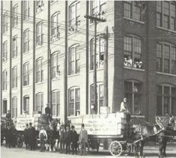
An overseas shipment for Canadian troops, Weston's Biscuit Factory, Toronto, 1915.

In August 1914, war broke out in Europe and thousands of Canadians signed up to fight for King and Country. As the Great War dragged on, shortages developed and some biscuit lines had to be discontinued, but George Weston Limited struggled through and remained profitable. Weston's Biscuits were also part of the war effort. One overseas shipment, destined for Canadian troops, proclaimed across its delivery wagons, "Ordered for Our Soldier Boys Fighting in France."