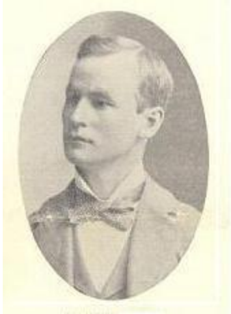
George Weston, ca. 1899.

George Weston was still a boy, just twelve years old, when he was apprenticed to a Toronto baker. For young George, the day started early and the hours were long. But he applied himself and learned all that he could about his trade.