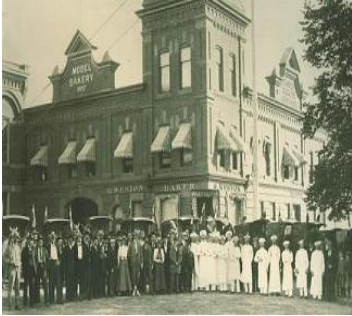
George Weston's Model Bakery, Soho and Phoebe streets, Toronto, ca. 1897.